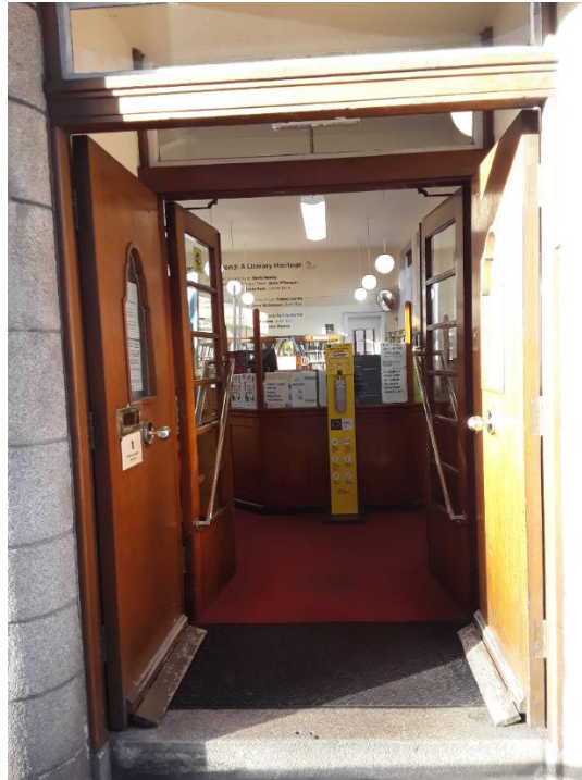
This is what our entrance looks like.