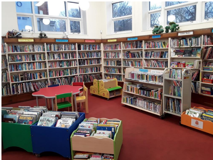
This is the children's library. There are lots of great books. You can borrow books to take home.